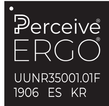
GlobalFoundries 22FDX ® low-power 22nm FD-SOI process technology